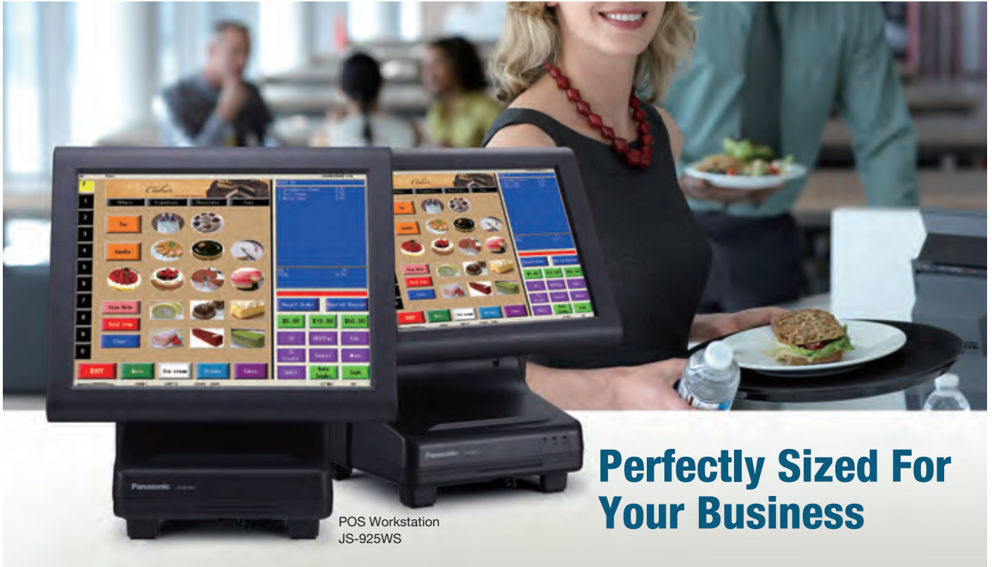
POS Workstation JS-925WS