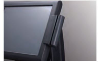
Magnetic Stripe Reader