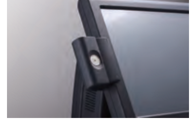
Dallas Key Reader